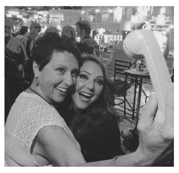
Baby Boomers will get this 🔊 😉 Too Funny!!

Nutritionist: You should eat 1200 calories a day.